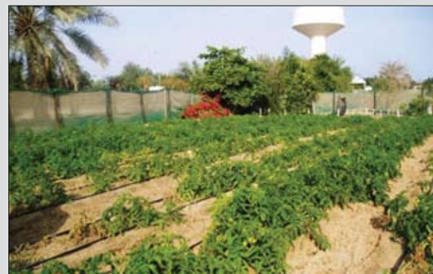
Fig. 2. Bahrain trees and vegetables tests in 2004