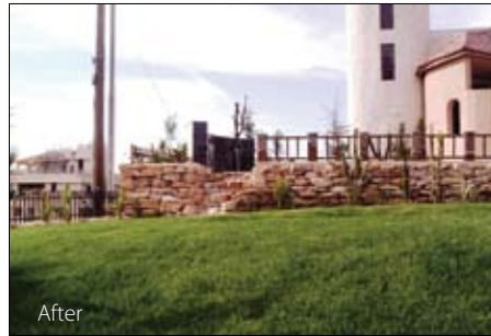
Fig. 3. Jordan lawn grass test in 2005 (1)