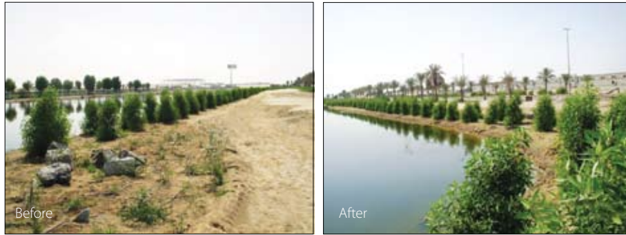
Fig. 5. Dubai, UAE salt lake test in 2008 (1)