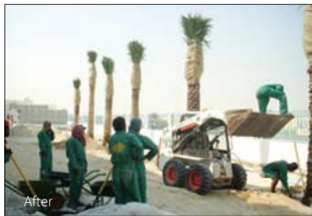
Fig. 4. Dubai, UAE palm test in 2007 (1)

of the transplanted plants. The general qualitative parameters of two basic humic ameliorant products are represented in booklets or at web-site www.aridgrow.info