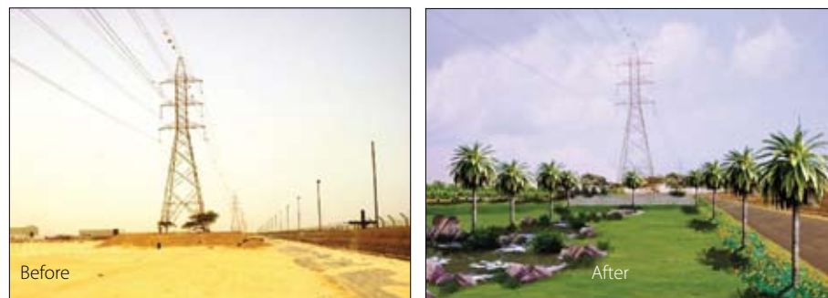
Fig. 6. Dubai, UAE lagoon test in 2009

and soil properties so to the irrigation conditions specificity. Here we mean the scheme of the agricultural areas arrangements, rates, periodicity and specifications of the irrigation. As to the properties of the regional ground and soils, it is rather important for us its mineralogical composition and a specification of the irrigation water.